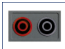
Jacks: Two standard safety banana jacks (4mm)